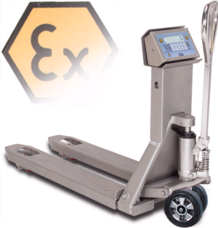
TPWX3GDI: pallet truck scale in STAINLESS steel, for hazardous zones.