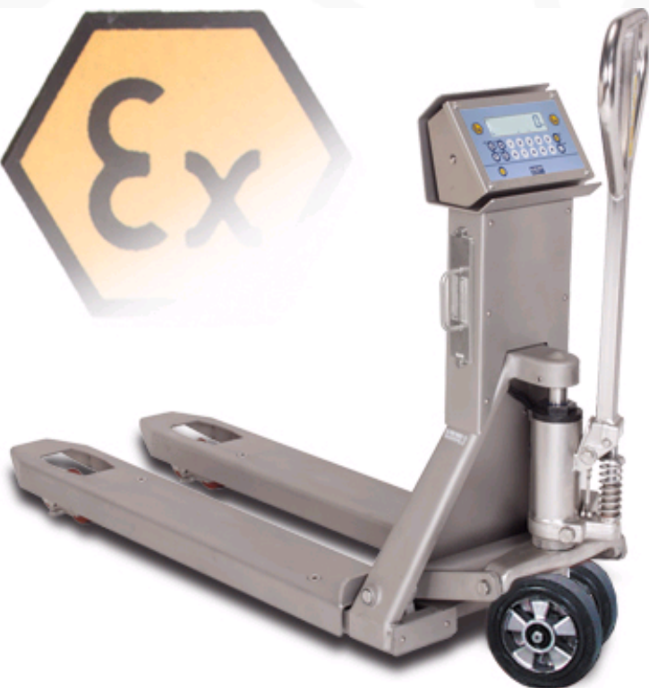
TPWX2GDI: pallet truck scale in STAINLESS steel, for hazardous areas.