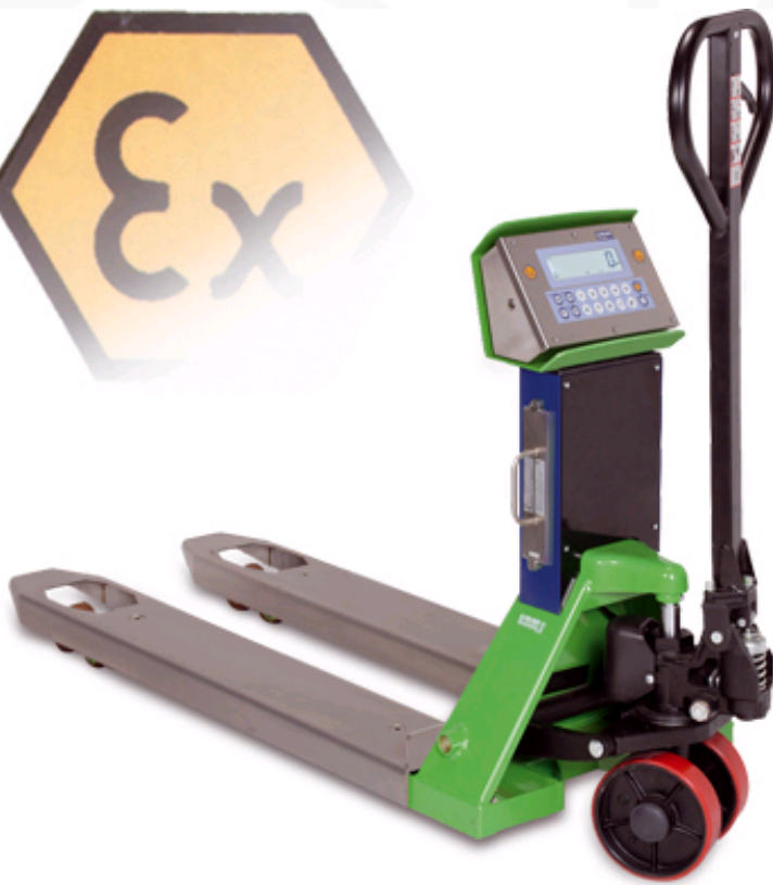
TPWX with optional STAINLESS STEEL forks.