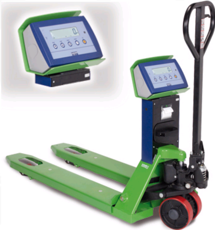
TPW20A with optional printer