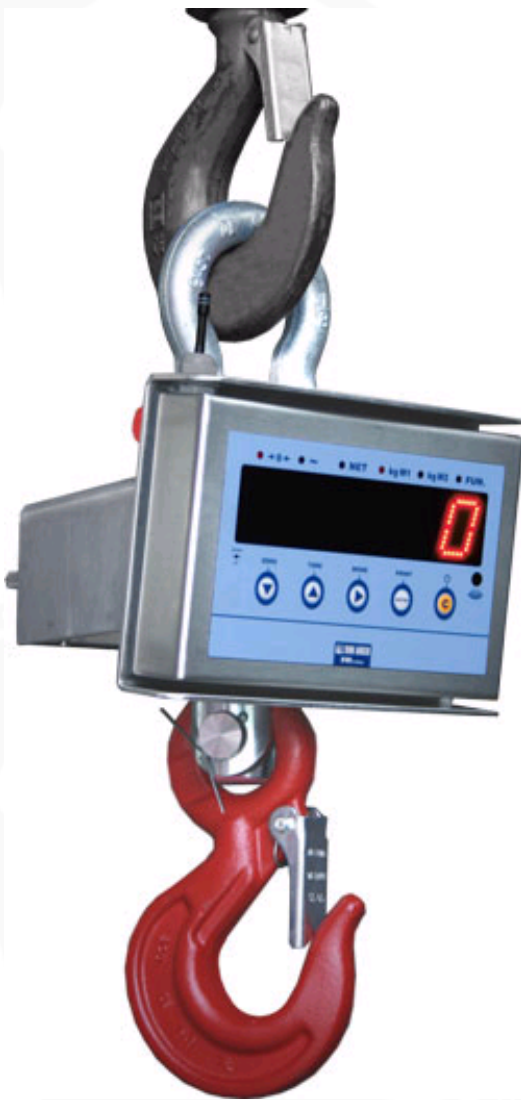
MCWK: Crane scale in IP67 STAINLESS STEEL.