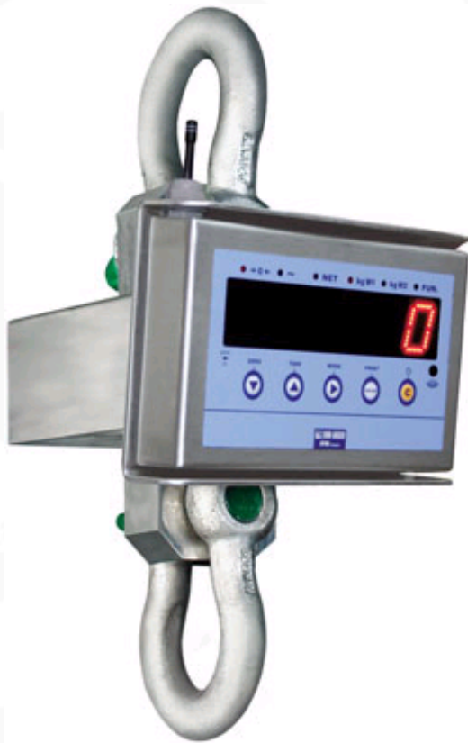
MCW09: IP67 stainless steel crane scales, with optional radio frequency module.

Stainless steel crane scales, with 40mm DOT LED large display, for maximum visibility from all angles and in any lighting condition, including direct sunlight. Sturdy and reliable, usable indoors as well as outdoors. Minimum reduction of the crane's lifting space. IP67 protection against dust and sprays.