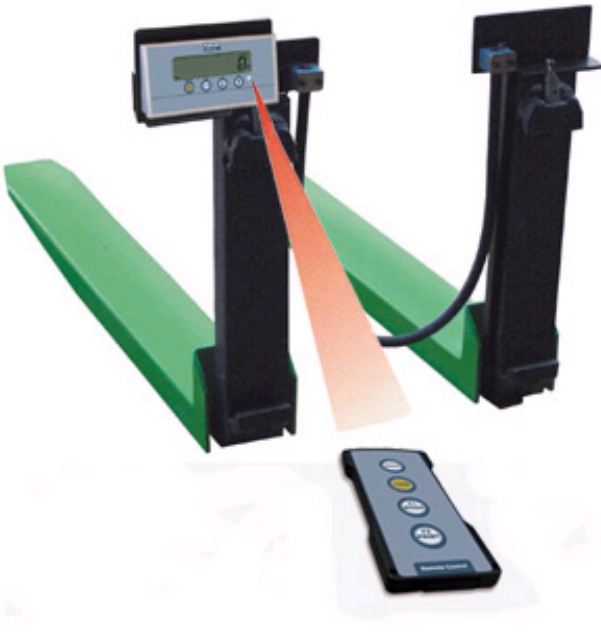
LTF with optional remote control