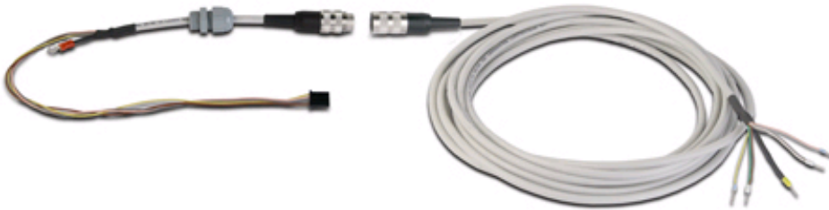
LCCB5C connection cable.