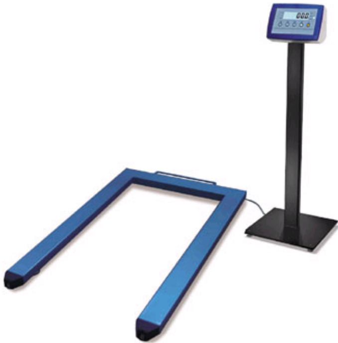
EPW15 with CSP optional column