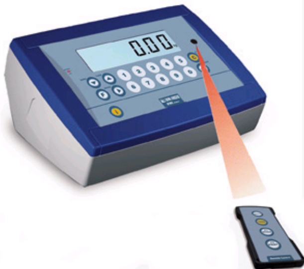
DFWK06XPCA with optional remote control